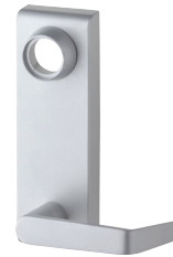
Escutcheon lever - Cylinder (212-L) Night latch (212-L-NL)