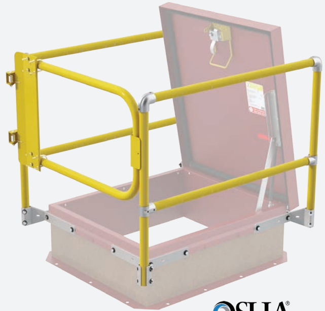
Safety Yellow Powder Coat option shown

Comes with standard chain barrier with easy spring clip attachment to guard against falls. (Not OSHA compliant)