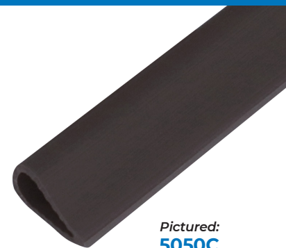
Pictured: 5050C (Charcoal)